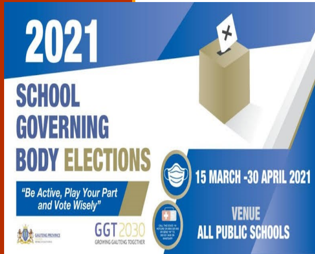
Department of Education's SGB elections poster

The School Governing body (SGB) for the 2021/2023 elections took place at Nexus Primary.