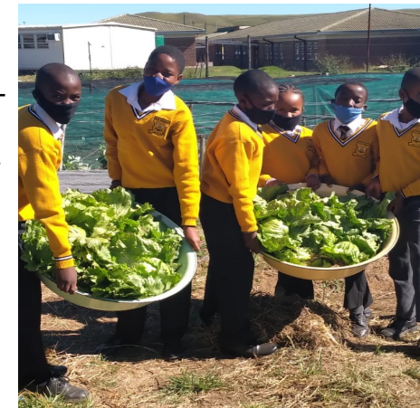
The food that we produce in the garden is taken to kitchen for feeding scheme.

Unfortunately our school didn't came up with the price, however pupils and teacher who took part got certificate of participation. ( www.tree.org.za #Eduplant)